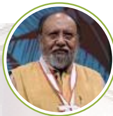
PROF. ASHIS NANDY

Distinguished Fellow of the Institute of Postcolonial Studies, Melbourne, Member of the Global Scientific Committee for Higher Education (UNESCO)